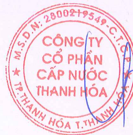
Le The Son