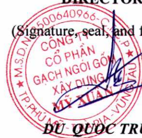
ĐU QUỐC TRUNG