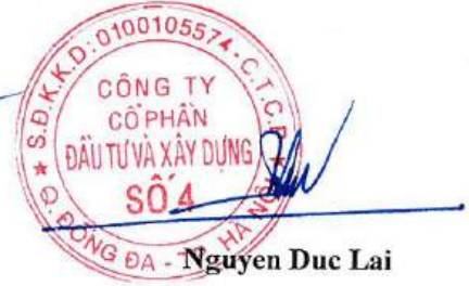
Nguyen Duc Lai

0 1 2 3 4 5 6 7 8 9 10 11 12 13 14 15 16 17 18 19 20 21 22 23 24 25 26 27 28 29 30 31 32 33 34 35 36 37 38 39 40 41 42 43 44 45 46 47 48 49 50 51 52 53 54 55 56 57 58 59 60 61 62 63 64 65 66 67 68 69 70 71 72 73 74 75 76 77 78 79 80 81 82 83 84 85 86 87 88 89 90 91 92 93 94 95 96 97 98 99 100