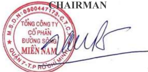
DANG DOAN KIEN