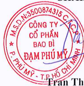
Tran Thuong Tin