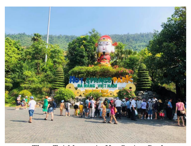
Than Tai Mountain Hot Spring Park