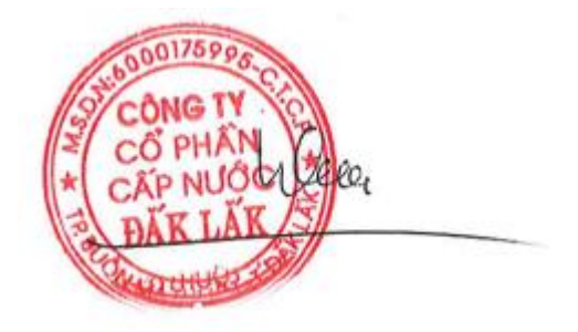
Do Hoang Phuc