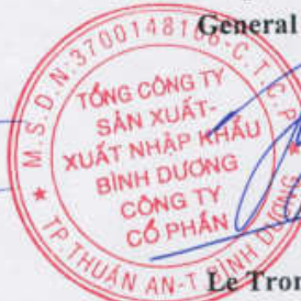
Le Trong Nghia