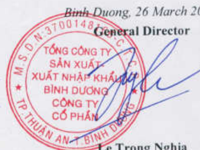
Le Trong Nghia