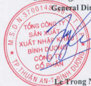
Le Trong Nghia