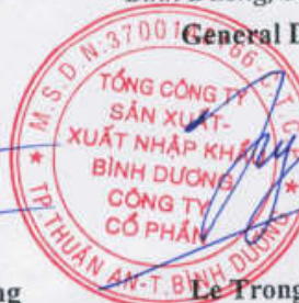
Le Trong Nghia