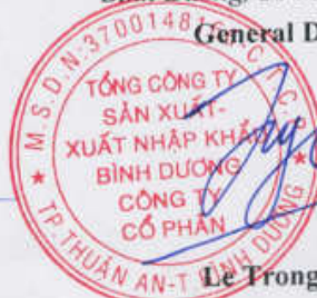
Le Trong Nghia