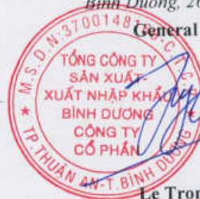
Le Trong Nghia