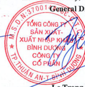
Le Trong Nghia