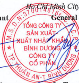
Le Trong Nghia